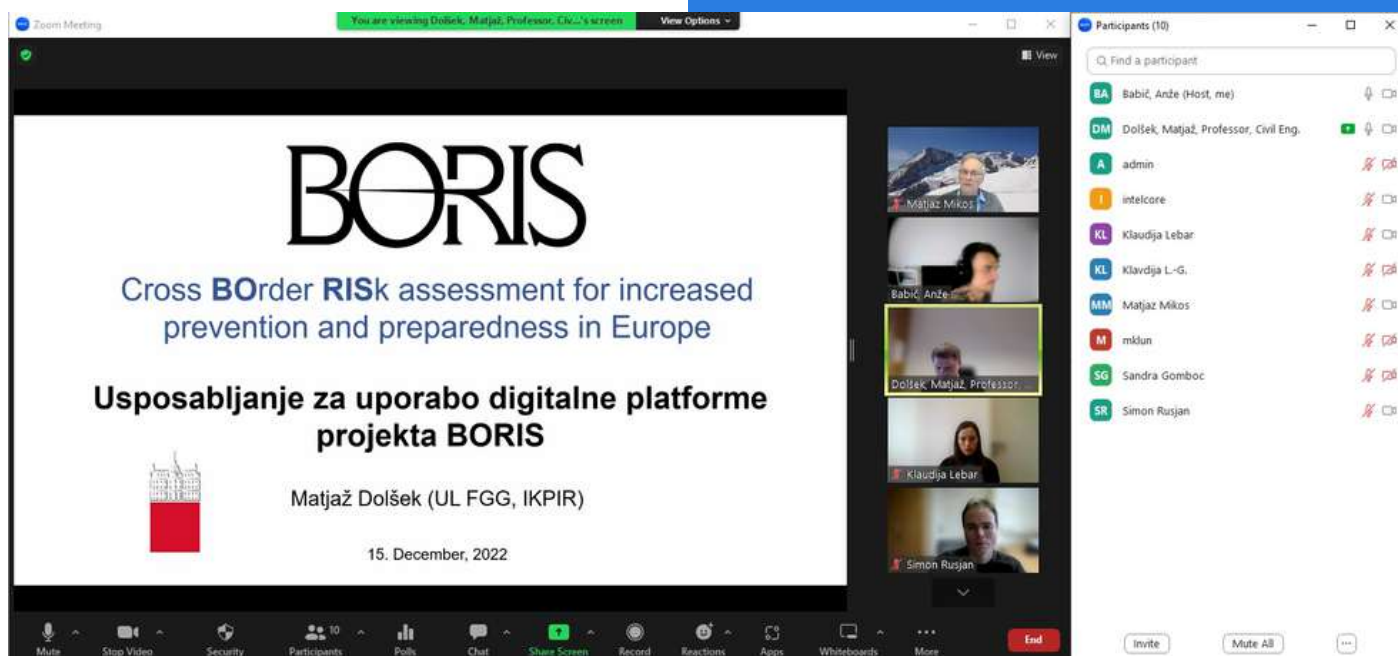
A screenshot from the training session for operational usage of the BORIS platform.