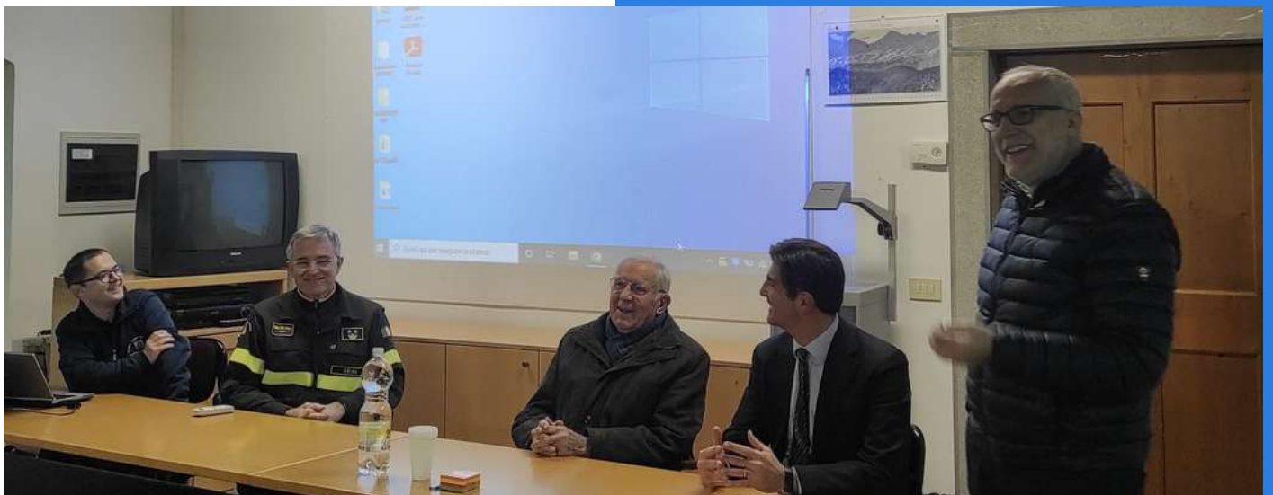
Representatives from Civil Protection Friuli, firefighters, association of Mayors of damaged towns, BORIS, and University of Udine

On the second day, the participants went on a field trip to Portis (Venzone) to visit the training camp for Firefighters based on the old Portis town damaged after Friuli 1976 earthquake. Subsequently, they met with the SERM Academy (Safety and Emergency Response Management international training school) including Associations of Mayors of the towns damaged by earthquake - the meeting took place at the TieraMotus Museum in Venzone.