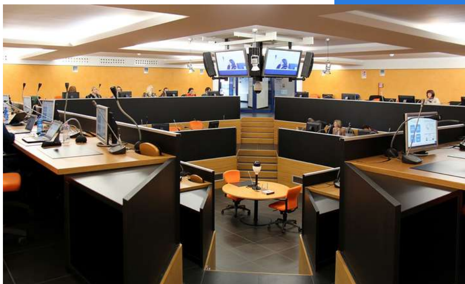
Location of the final conference in Pavia