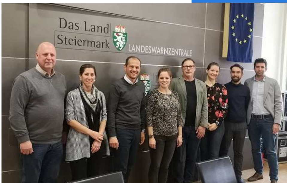
Participants of the Austrian BORIS training

Thanks to all the participants in the training! We are grateful for the great feedback and insightful discussions.