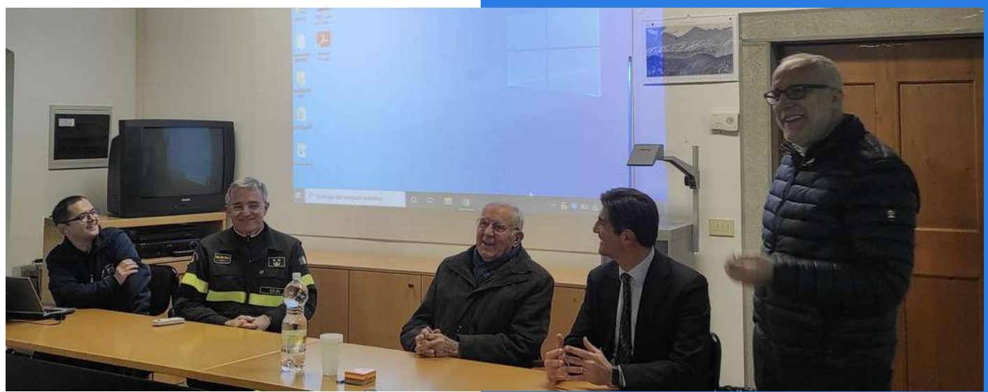
Representatives from Civil Protection Friuli, firefighters, association of Mayors of damaged towns, BORIS, and University of Udine

On the second day, the partcipants went on a field trip to Portis (Venzone) to visit the training camp for Firefighters based on the old Portis town damaged after Friuli 1976 earthquake. Subsequently, they met with the SERM Academy (Safety and Emergency Response Mangement international training school) including Associations of Mayors of the towns damaged by earthquake - the meeting took place at the TiereMotus Museum in Venzone.