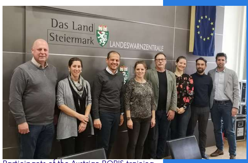
Participants of the Austrian BORIS training

Thanks to all the participants in the training! We are grateful for the great feedback and insightful discussions.